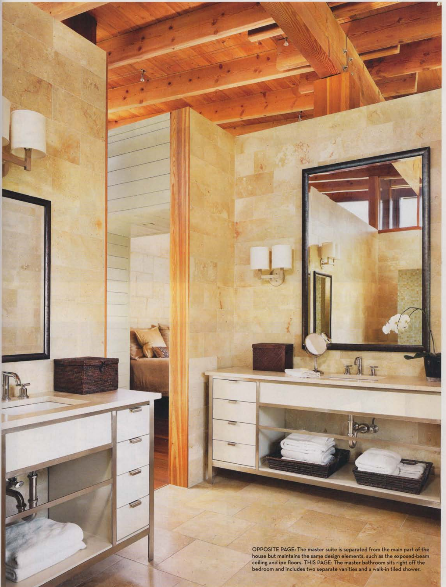
OPPOSITE PAGE: The master suite is separated from the main part of the house but maintains the same design elements, such as the exposed-beam ceiling and ipe floors. THIS PAGE: The master bathroom sits right off the bedroom and includes two separate vanities and a walk-in tiled shower.