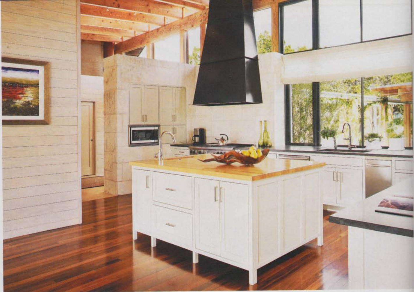
ABOVE: The kitchen and the adjacent family room are the most utilized spaces in the house. BELOW: The walls that separate each room never reach the ceiling, giving the home a very open, inviting atmosphere. OPPOSITE PAGE: Natural materials are used throughout the home, including steel, wood and glass, to keep the home connected to the outside environment. "I try to stay away from too many painted surfaces," says architect Mell Lawrence.